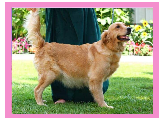
Greece (Golden Retriever)