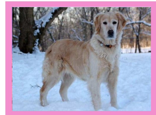
Petunia (Golden Retriever)